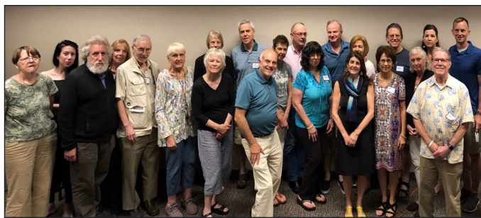
Connecticut Support Group members

Q&A session. Following her presentation and after a group picture and short break, we went around the room discussing our individual WM stories and treatments. We concluded our meeting at 4:30, and a small group of meeting attendees had a nice dinner afterward at a restaurant downstairs in the Mall. In total we had approximately 25 attendees.