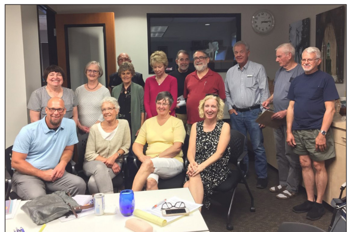
Oregon/SW Washington Support Group members