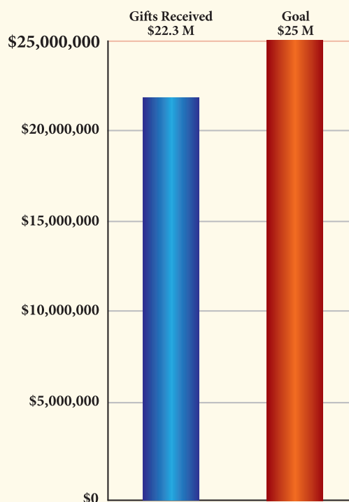
Imagine a Cure Campaign Progress Report as of September 3, 2019

There are several ways that you can shift tax dollars to charitable dollars and support the IWMF's mission at the same time. These include a zero tax gift and sale, a donor-advised fund, the outright gift of an asset, or an IRA charitable rollover. As you think about tax planning, this may also be an appropriate time to think longer-term about a legacy gift to the IWMF.