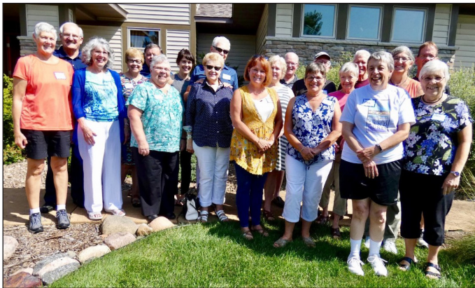
The MN/Western Wisconsin group posed after meeting and sharing a potluck lunch.