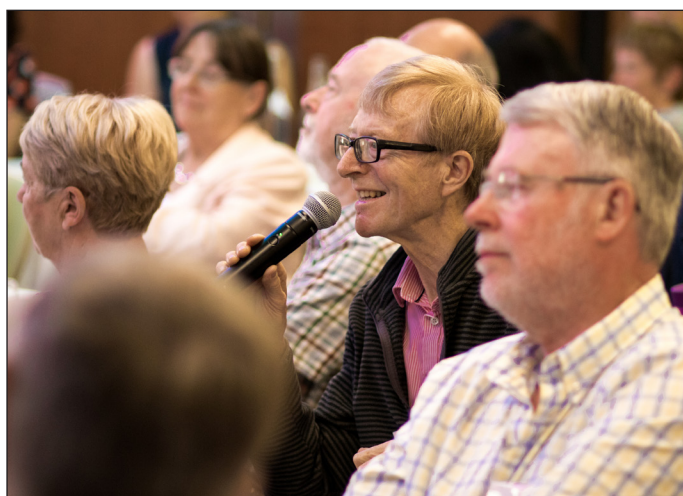
Delegates during the question and answer session