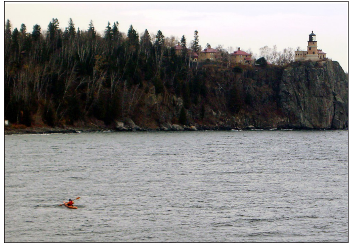
Kayaker and Split Rock Lighthouse on Lake Superior

I couldn’t have known that the times I spent bouncing through big waves, or paddling into stiff winds, were the moments when I was learning the biggest lessons of my life. Lake Superior is the harshest environment I know. I’ve paddled through ice in January that without warning became too thick to move through; I’ve been caught in a sudden hailstorm, and struggled through fresh gales. Eventually I’ve always found a quiet bay or a sandy beach, a place of shelter and calm. I’ve seen magnificent double rainbows after a storm and completely relaxed as the lake’s huge rollers rose and fell beneath my kayak. I’ve admired the inexorable action that