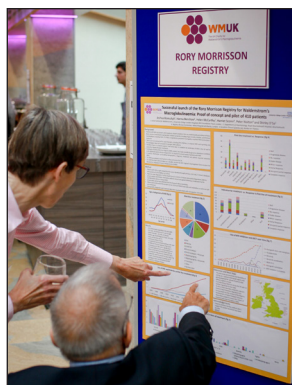
Delegates in the exhibition area viewing posters