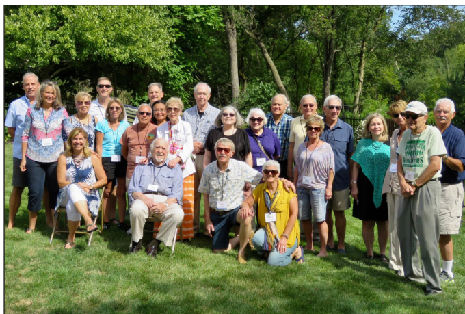
Chicago Support Group members