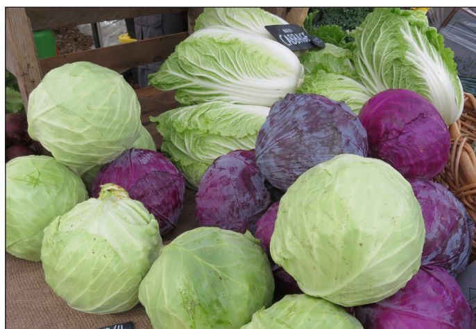
Green, purple, and Napa cabbages

(chicken, turkey, or pork), or sautéed tofu marinated in turmeric would be shredded cabbage braised in one of the new fermented, dry apple ciders you can find these days. Add some apple chunks and minced fresh thyme. Cook it down until the liquid is syrupy. Season with salt and pepper.