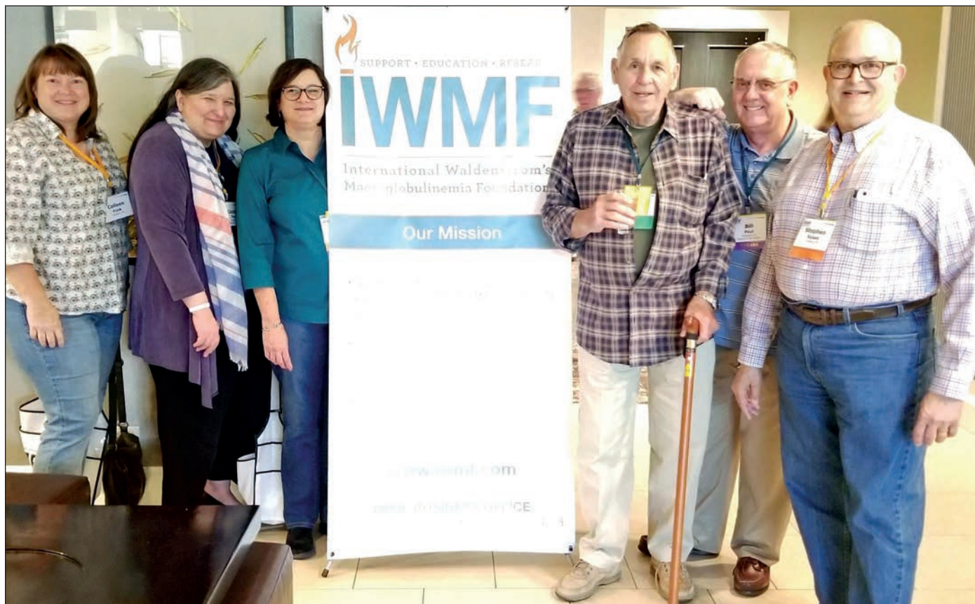
Memphis Support Group members at IWMF Ed Form 2018