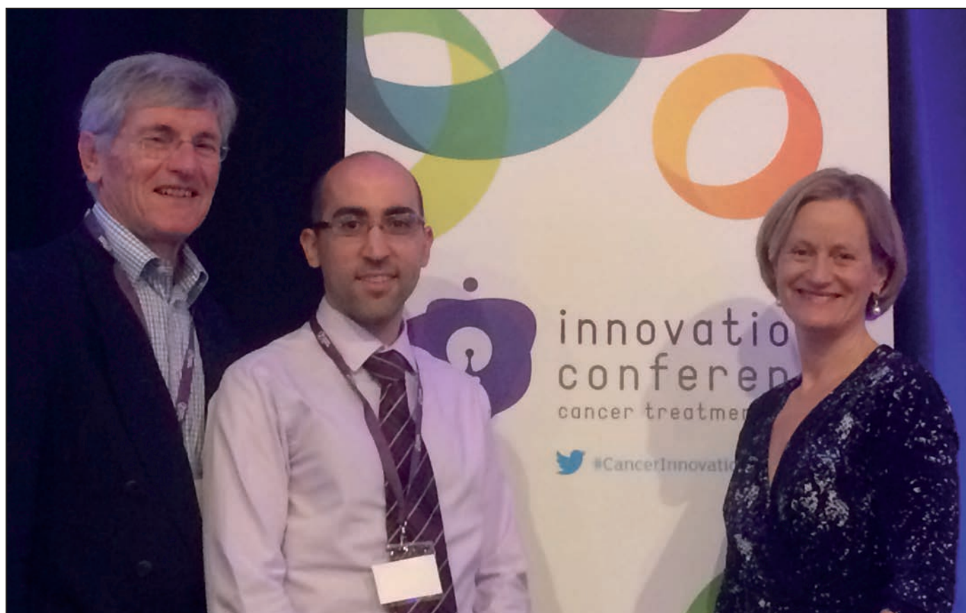
WhiMSICAL Investigators at Cancer Institute of NSW Innovations Conference, Sydney, Australia