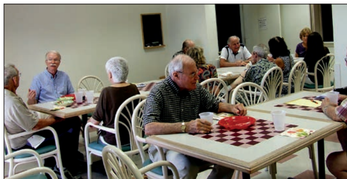
Susquehanna Valley Support Group – Support is social too.