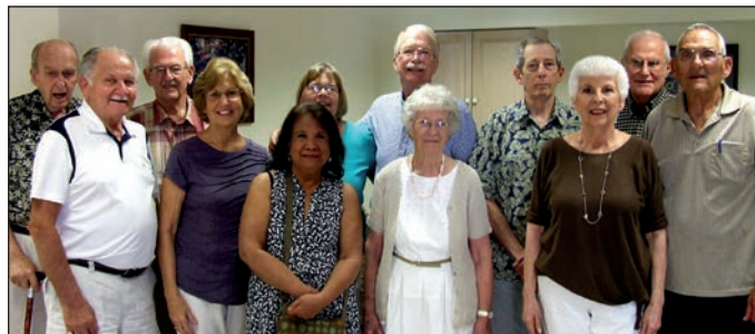
Susquehanna Valley Support Group July meeting