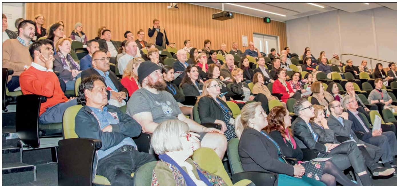
Crowded auditorium at the Concord Haematology Clinical Research Symposium, Sydney, Australia