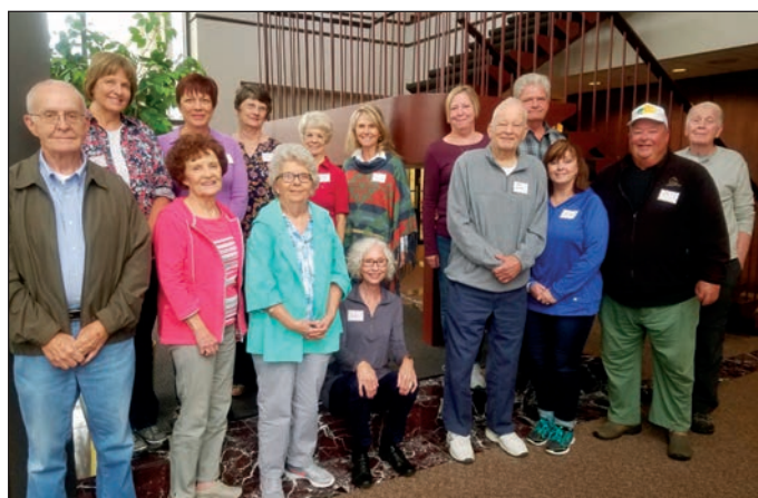
Indiana Support Group at the Indianapolis LLS office.