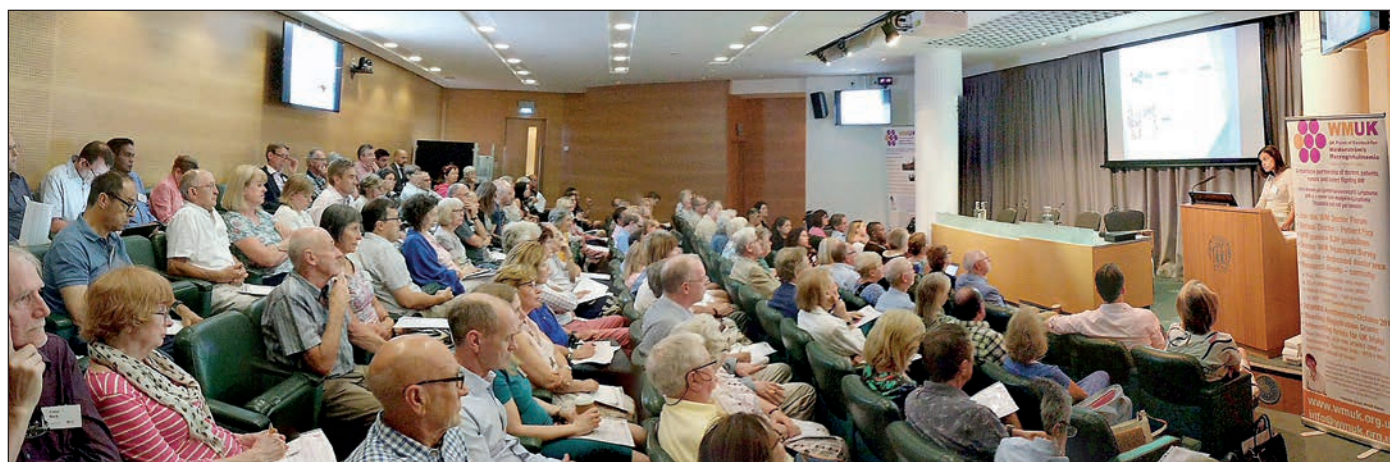
WMUK London Summit at the Royal Society of Medicine on July 1