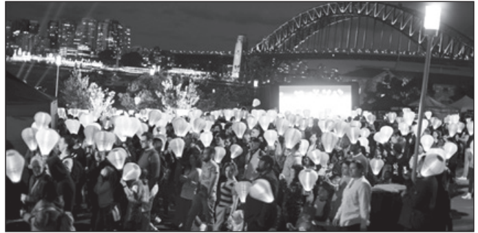
Light the Night 2017 in Sydney: Light the Night is a unique annual fundraising event sponsored by the Leukaemia Foundation of Australia.

Leukaemia Foundation blood services coordinators are assisting in recruiting new members for WMozzies in 20 locations around Australia. WMozzies membership is only 10% of the estimated number of people in Australia with WM. The Leukaemia Foundation professional staff is assisting by distributing the new WMozzies brochure to WM patients with whom they are in contact. Leukaemia Foundation blood