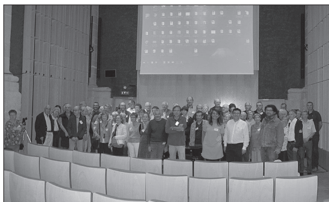
The patient-doctor day in Limoges sponsored by Waldenström France drew 74 participants from all over France

The morning was reserved for participants to gather and meet up with both old and new acquaintances – and there