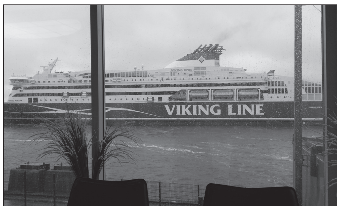
The venue for the meeting of the Waldenström's macroglobulinemia patients' group was excellent, but the weather in Helsinki was cold and the sea breeze felt more like a hurricane. We were happy to stay indoors in the hotel and the congress center, enjoying the view of the passenger terminal from the restaurant windows.

of the stem cell laboratory. In addition, there were six Finnish hematologists presenting on the new findings in their fields of study. All lectures had time set aside for patients' questions and discussion.