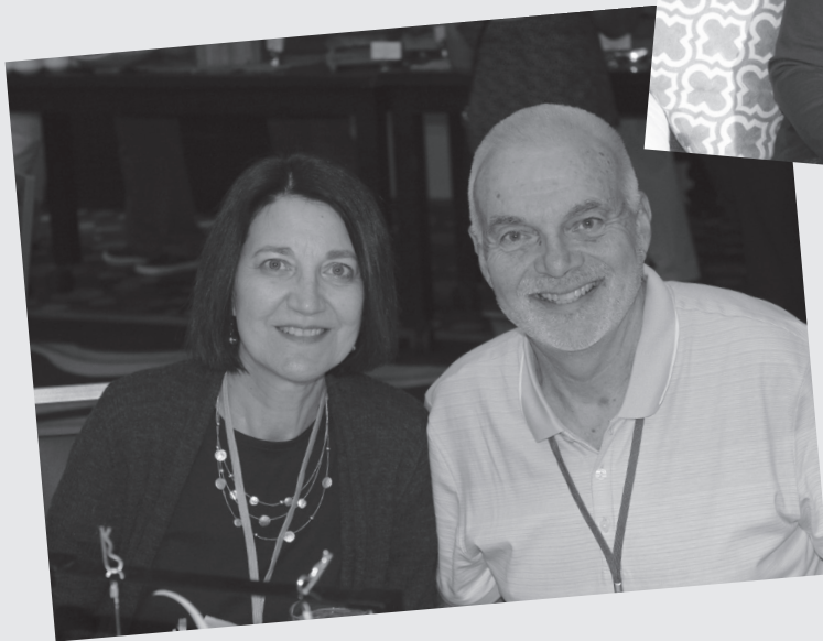
Imagine a Cure Campaign Progress Report as of October 31, 2017