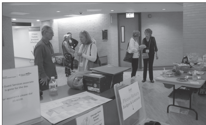
Back stage setting for the Chicago support group at Advocate Lutheran General Hospital: a tempting buffet, plenty of hand sanitizer, and a concern for recycling.