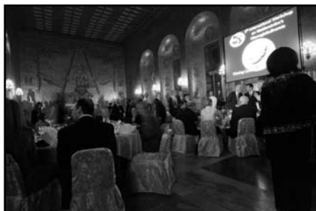
Dinner in Nobel Hall

The more than 100 patients and their family members who attended the first European Patient Forum in Stockholm on Sunday, October 19, included residents of Sweden, Norway, Finland, Iceland, the Netherlands, Belgium, France, the United Kingdom, Ireland, and Albania. Planned as an adjunct to the Fifth International Workshop on Waldenstrom's Macroglobulinemia (IWWM5) held October 15-18, the program featured presentations by physicians and researchers from Sweden and the United States and by a panel of three patients, also from the United States.