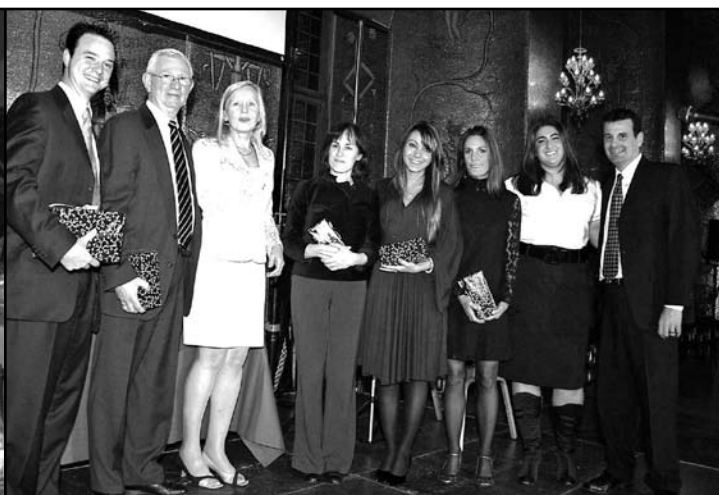
5th International Workshop on Waldenstrom's Macroglobulinemia organizers and volunteers at closing ceremonies