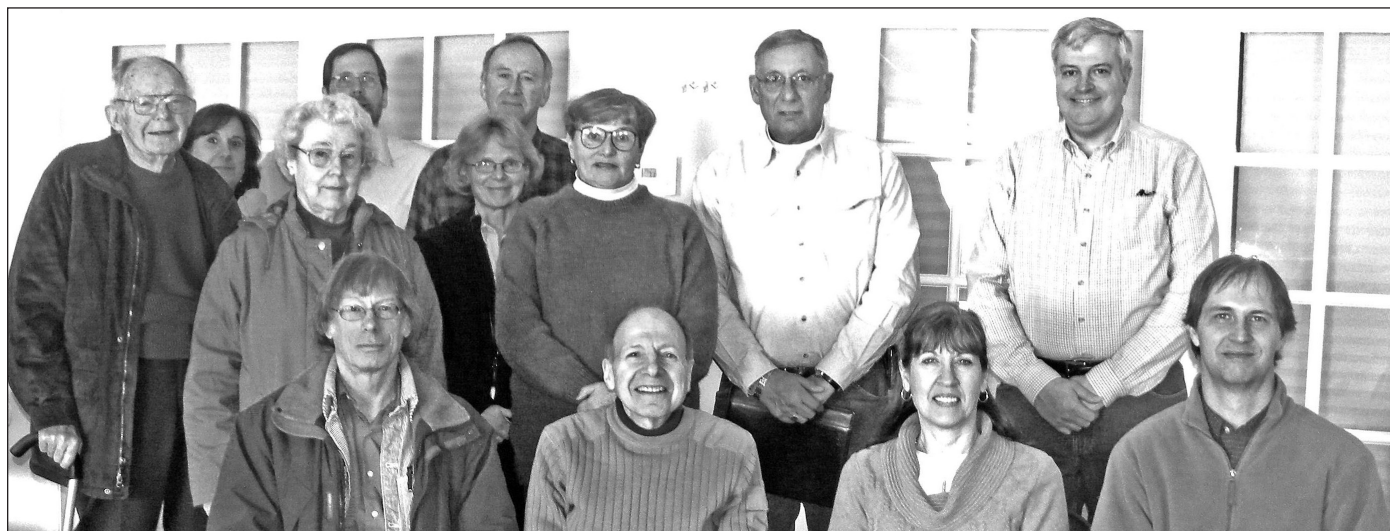
The northeastern New York/Western New England support group gathered in February.